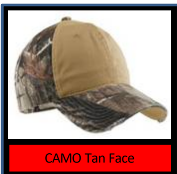
CAMO Tan Face