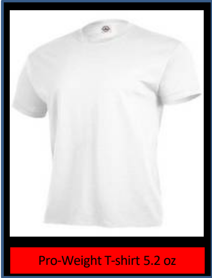
Pro-Weight T-shirt 5.2 oz