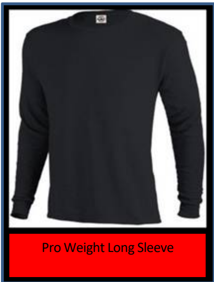
Pro Weight Long Sleeve