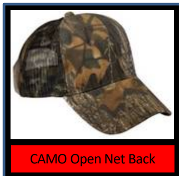
CAMO Open Net Back